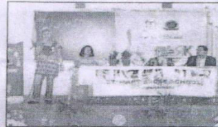
READ ON: The event was conducted at St Mary's ICSE School at Koparkhairane

Students, parents and teachers attended this event. Students bought their choicest books from the 'author's corner' and also participated in a book exchange programme.